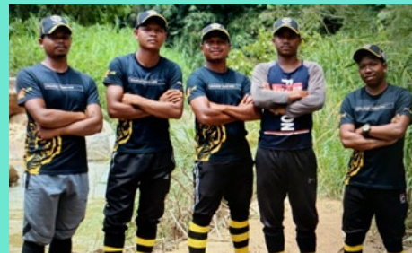
Members of the Tiger Patrol Unit, funded by RFC Coterie members, in Malaysia.

The partnership's impact on conservation