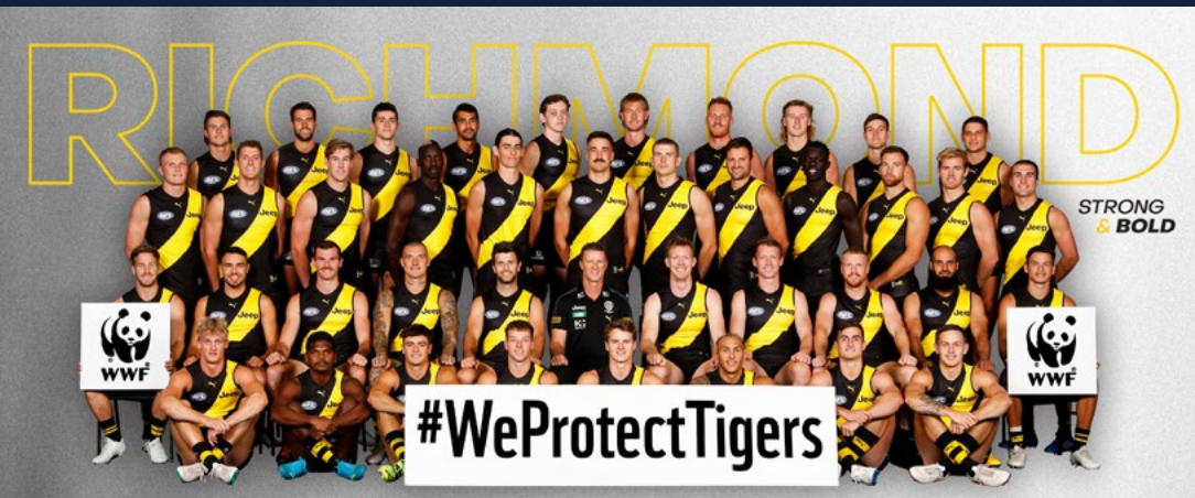
2021 Richmond Football Club WWF-Australia team photo.